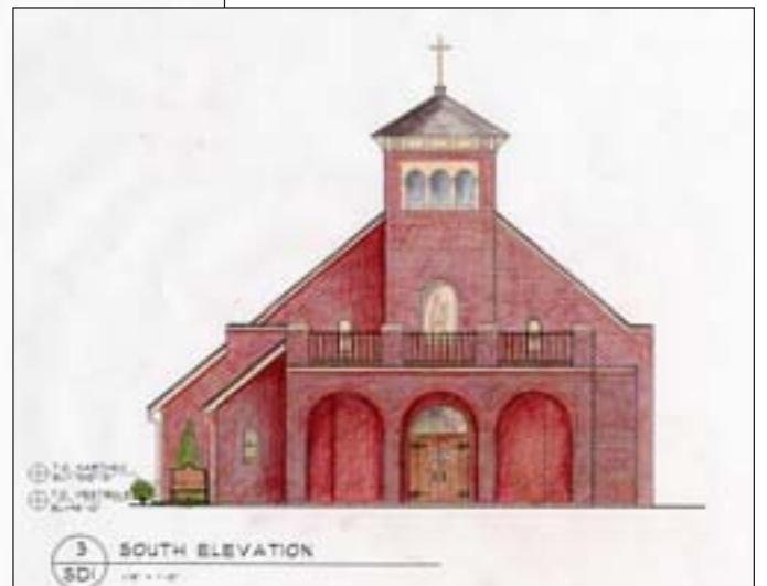
Proposed front view of the church