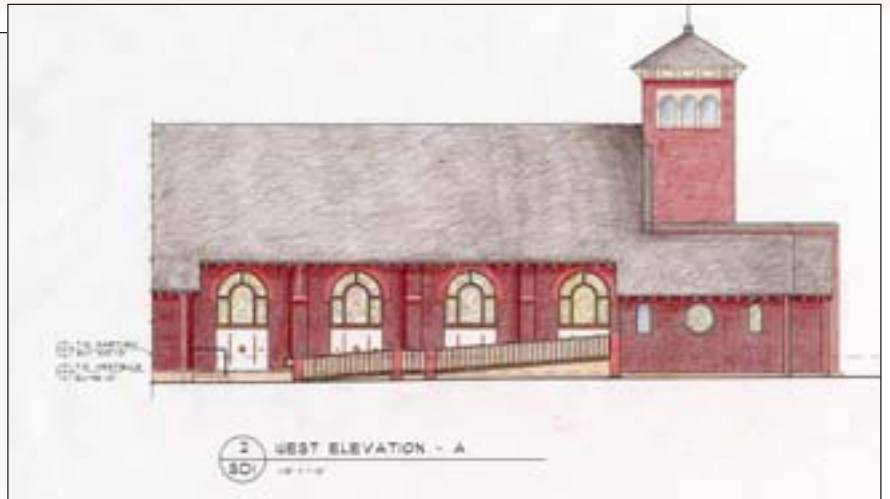
Side view of the church